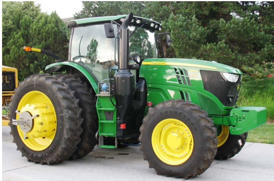
JOHN DEERE 6215R DIESEL