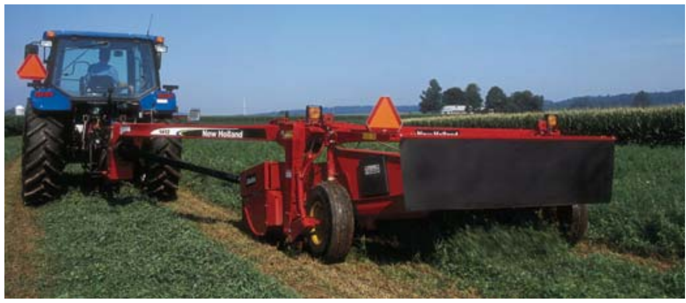
Adjustable header flotation springs and on-the-go cutting angle adjustment allow you to get all the crop without scalping or knife damage.

• For optimum flotation and protection, skid shoes are 8-inches wide and extend behind the module a full two inches.