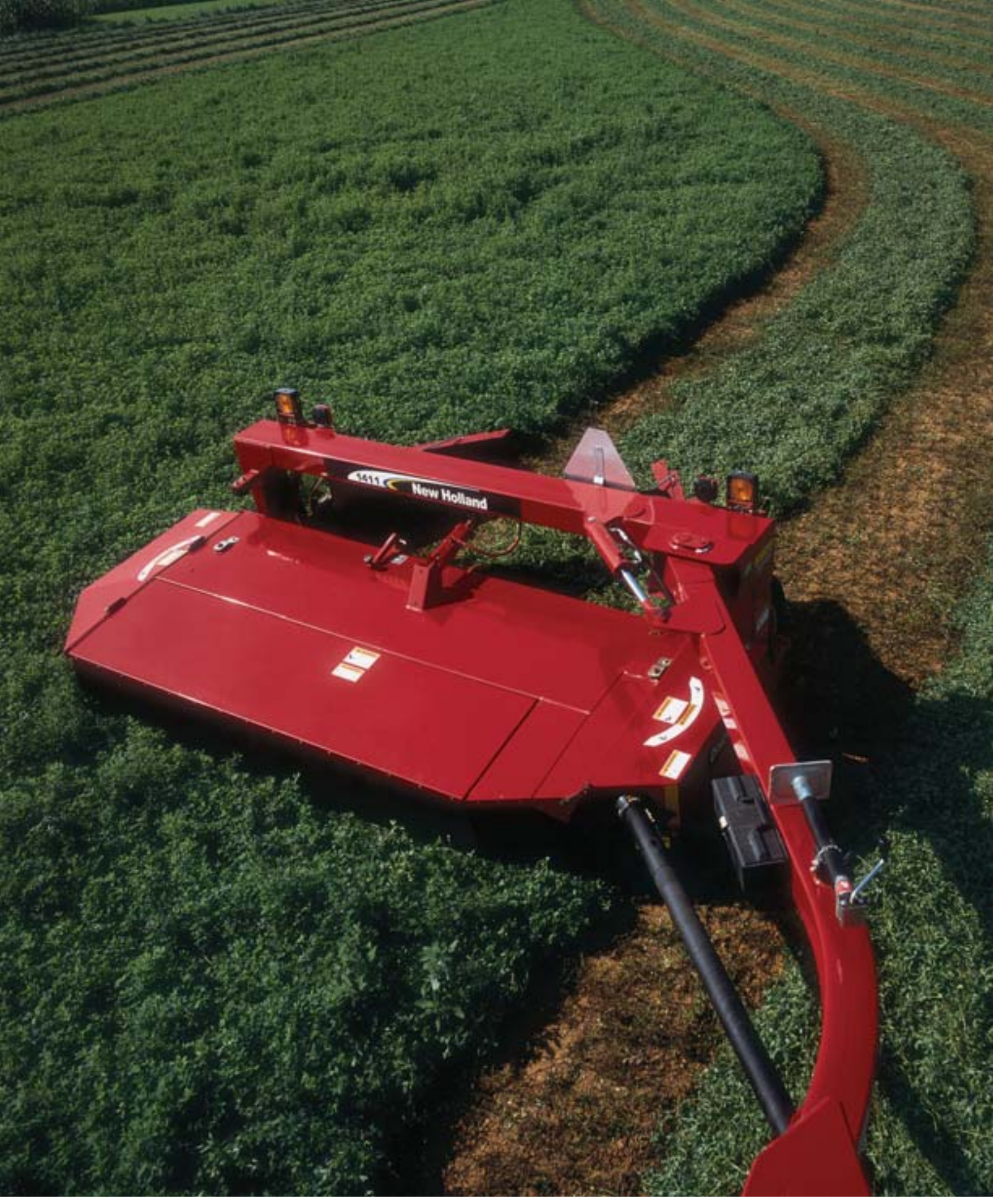
The Discbine header is suspended independently of the trail frame, allowing it to react both vertically and laterally to changing ground contours.