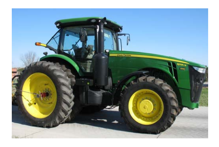
JOHN DEERE 8335R DIESEL