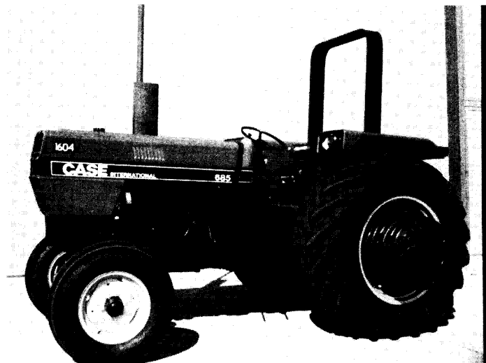
Case International 685 Diesel